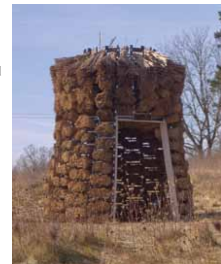
Left and above: "Hair, Spikes, Cattail, and Turkeyfoot."