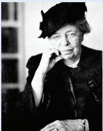
Mrs. F.D. Roosevelt